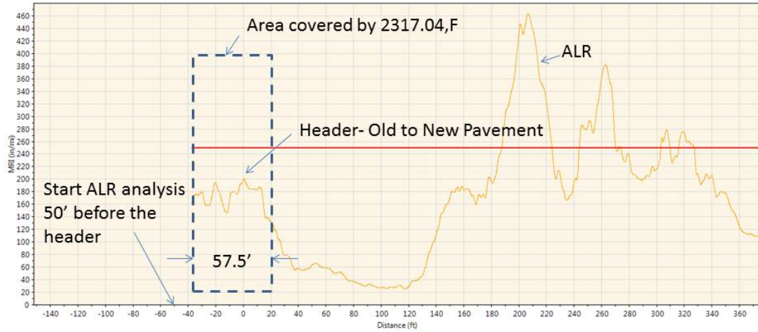
Figure 1. Area of Localized Roughness (ALR) Analysis at the Beginning of Project (Same at End of Project)

Note: The ALR at any point covers profile 12.5\' back and 12.5\' forward.